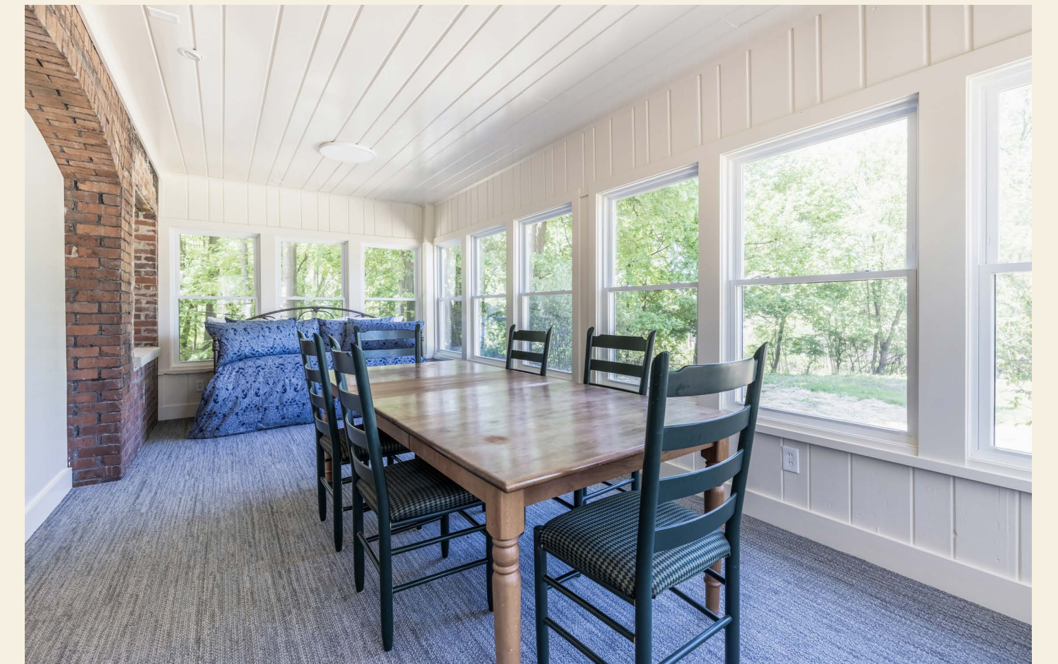
Carriage Suite #1

For Rates and Availability, Please contact us at (216)-440-0955