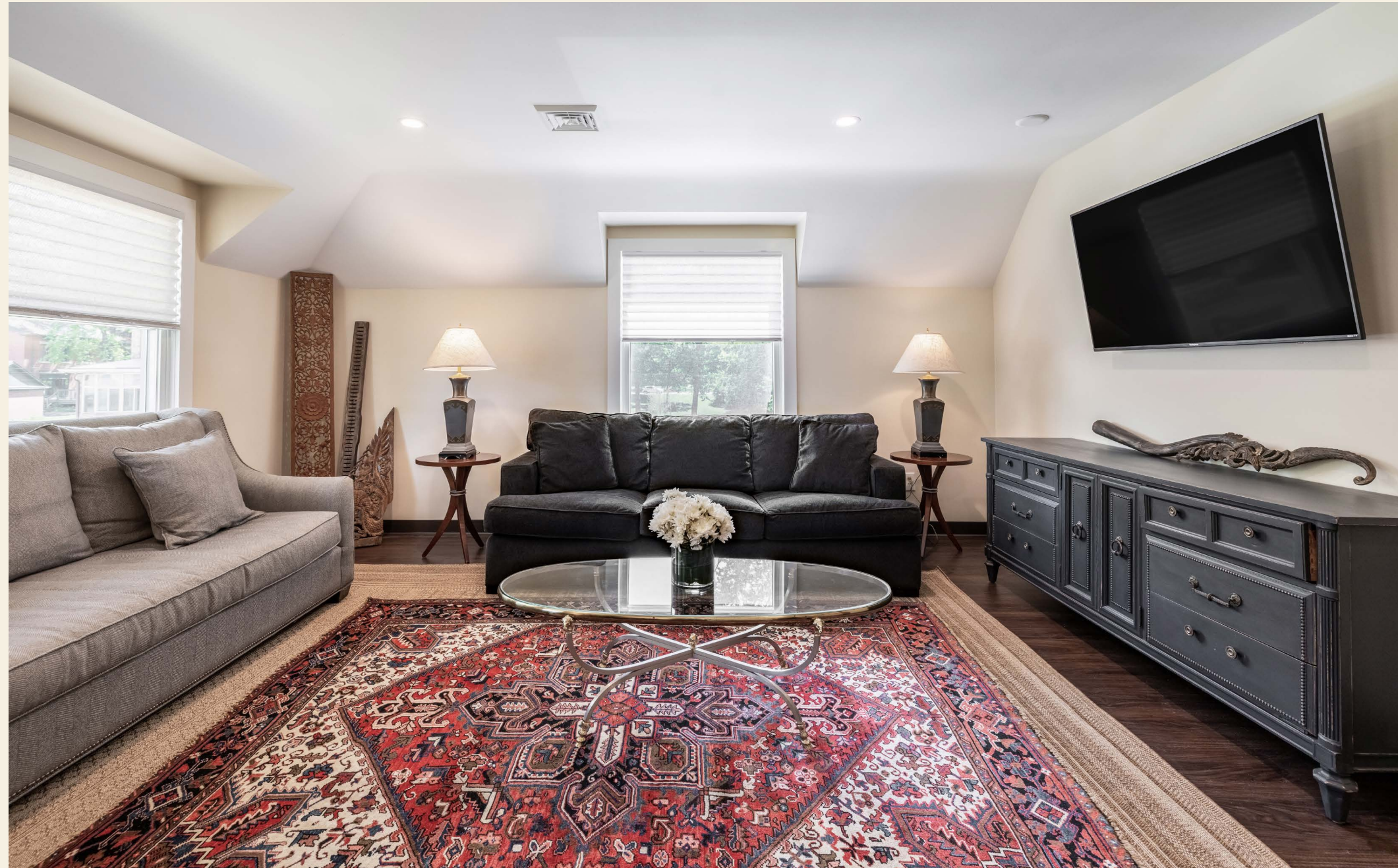
Second Floor, front 880 Sq Ft