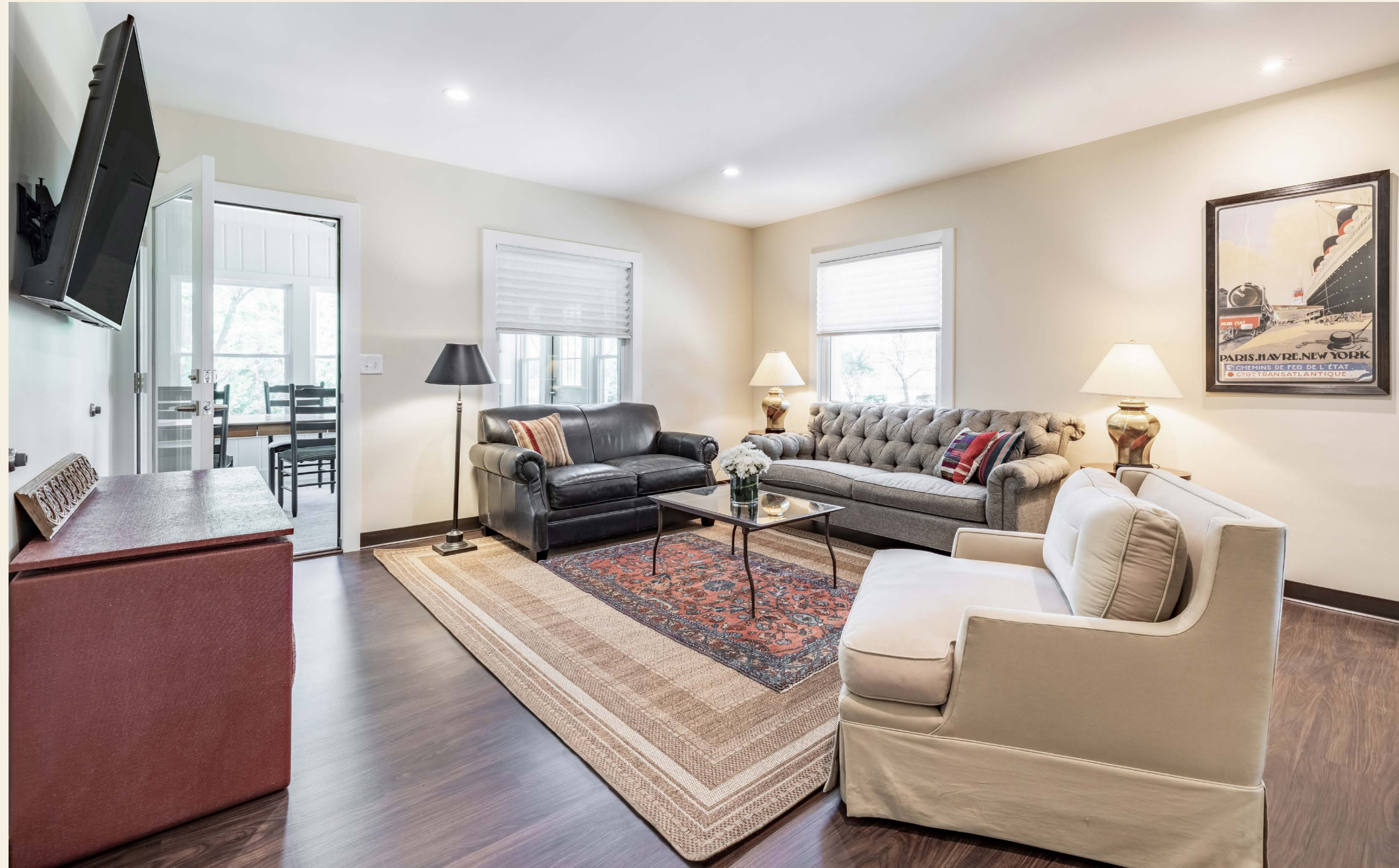
Ground-level, rear 980 Sq Ft