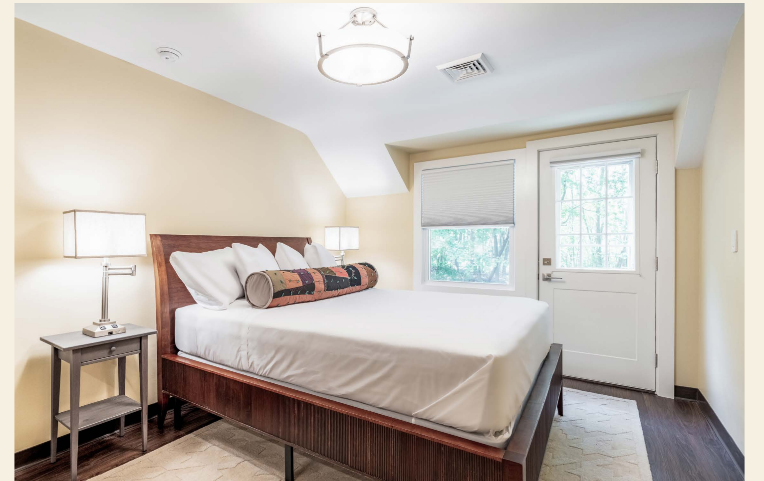
Carriage Suite #2

For Rates and Availability, Please contact us at (216)-440-0955